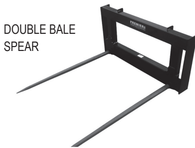
DOUBLE BALE SPEAR