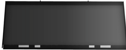
SKID STEER WELD-ON MOUNT BLANK